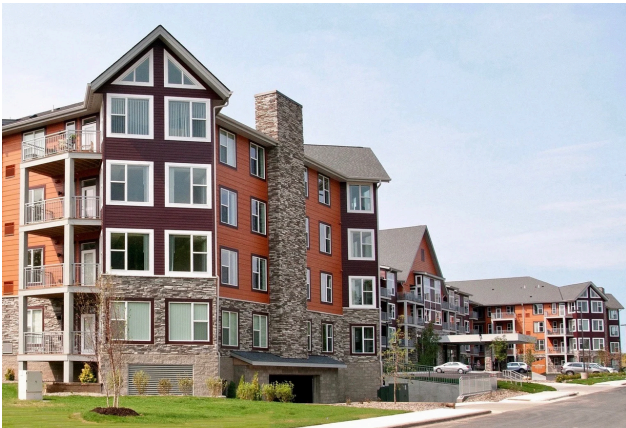
Grainwood Senior Living 168-unit subsidized affordable apartment building for adults 55+