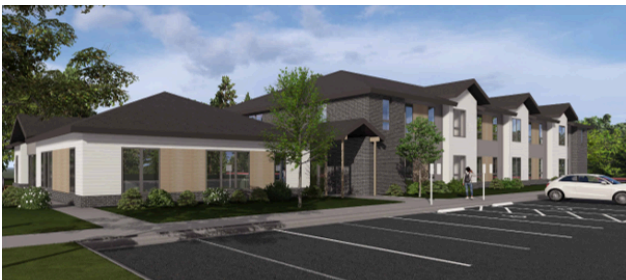
Scott County Specialized Emergency Family Housing will provide 14-units for temporary homeless family housing and to be constructed in 2025.