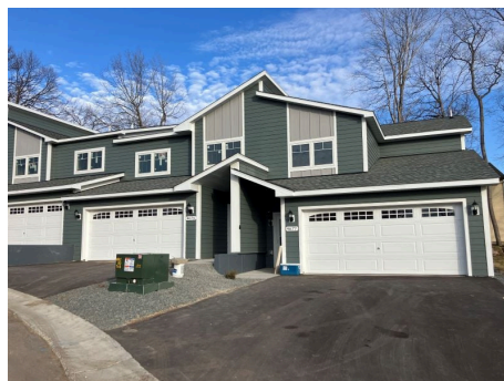
Towering Woods Townhomes is a development of 12 attached townhome units being constructed by Twin Cities Habitat for Humanity.