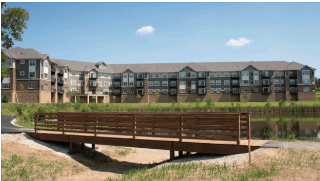
Pike Lake Marsh is a 68-unit subsidized workforce housing apartment building